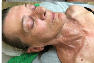
After 1 Enzyme Treatment

The DMK homecare products are making such an improvement with my skin. I have always had acne and breakouts. The DMK products target my skin concerns and reduce blemishes. When I started taking DMK's EFA tablets my skin was brighter & clearer after only a couple of weeks!